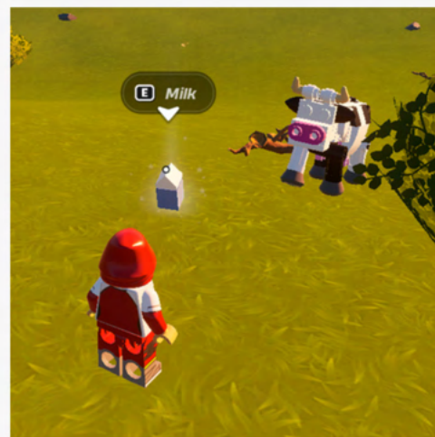
Don't kill cows but pet them to get milk

Gather sustainable materials in your inventory. Don't cut trees but collect stray wood instead.